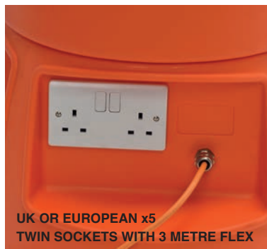
UK OR EUROPEAN x5 TWIN SOCKETS WITH 3 METRE FLEX