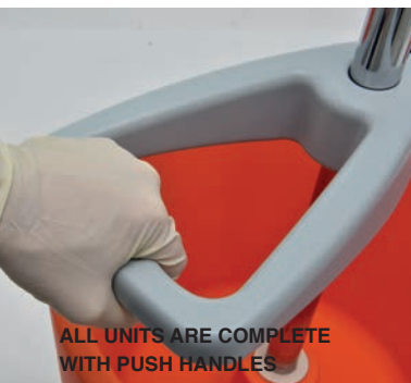
ALL UNITS ARE COMPLETE WITH PUSH HANDLES