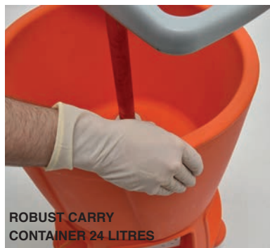
ROBUST CARRY CONTAINER 24 LITRES